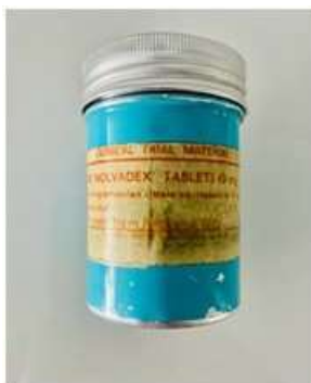
Figure 1: Nolvadex ® tamoxifen 10mg. ICI PHARMA

In the 1960s, radical mastectomy was the only available option and did not differentiate by type of cancer, later the use of tamoxifen (figure 1) was discovered as a therapeutic alternative to chemotherapy in some subtypes of breast cancer in the 1980s.