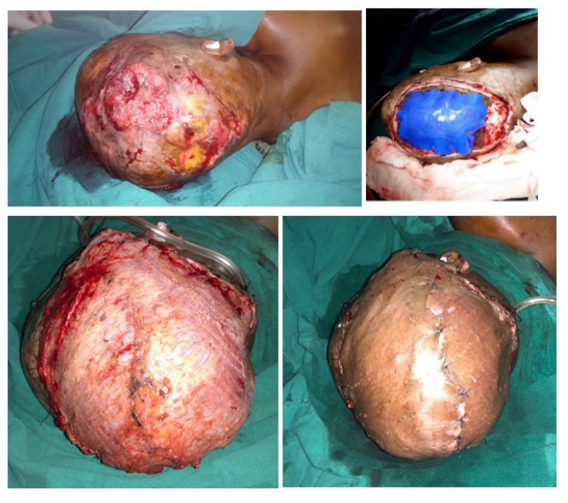
Figure 1: 1. A – The scalp lesion, 1. B – PTFE dural patch covering brain after excision 1. C – Latissimus dorsi muscle flap over dural patch, 1. D – STSG covering the muscle flap

After 2.5 years of completion of treatment, the patient did not show any evidence of local recurrence, awaiting his Calvarial (skeletal) reconstruction if considered necessary. Of course, any further reconstructive surgery for him will be planned after his corrective cardiac surgery. He has been advised for a regular follow up in view of residual tumour tissue in the brain parenchyma which could not be resected completely (Figure 1 and 2).