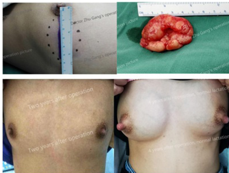
Figure 2: 20-year-old, 5cm fibroadenoma surgery (top left and right), follow-up 2 years after surgery (bottom left), and normal breastfeeding 4 years after surgery (bottom right)