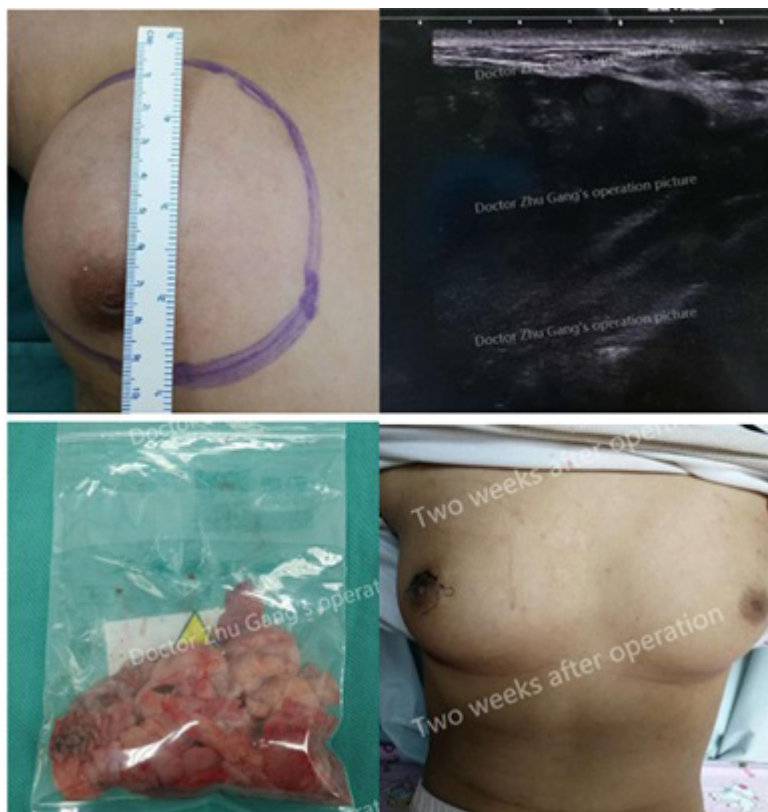
Figure 3: 10-year-old child with 10cm juvenile fibroadenoma surgery and 2-week postoperative photos