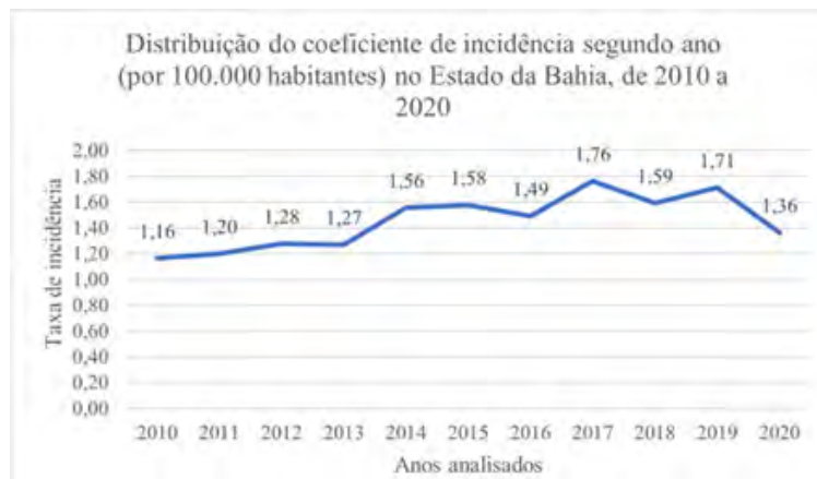
Graphic 1: Source: MS/SVS/CGIAE - Mortality Information System - SIM; Estimated population based on the 2010 census.

When analyzing the number of deaths in the period studied, an average of around 203.36 deaths/year was obtained. The lowest number was 163 (7.28%) in 2010 and the highest was 247 (11.04%) in 2017. For the entire period studied, there was an upward curve, with periods of greater stability from 2010 to 2012 and 2014 to 2016. Looking at the incidence coefficient, 2017 and 2019 had the highest values (respectively 1.76 and 1.71 deaths/100,000 inhabitants), while the first two years of the study period, 2010 and 2011, had the lowest coefficients of the period: 1.16 and 1.20 deaths/100,000 inhabitants (Graphic 1).